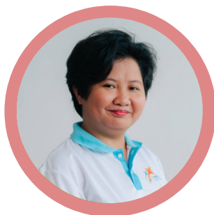
CESS MARCH 13